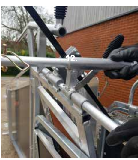
12. Pull the Panel Connector towards the Small Grip -Panel and secure using a Pipe Pin (3). Next Secure the Black Slider located on the RaceGrip Handle to the Small Grip Panel usingPipe Pin (3).